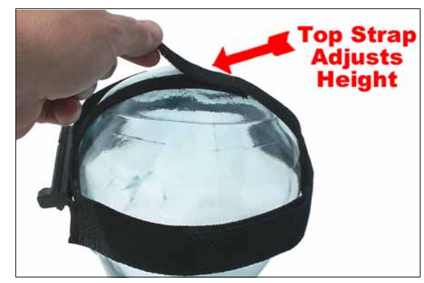
Adjust height using the small velcro connection on the top strap.