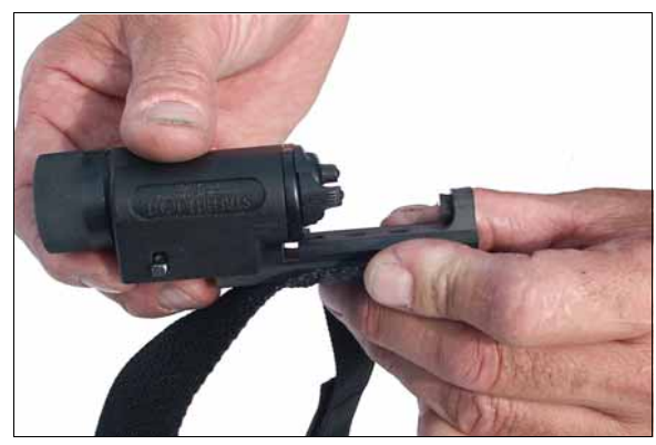
To use, simply snap your detachable tactical light onto the headband rail. The headband rail will accept any M3/M6 Steamlight, Surefire X200, Glock light, Z5 light, or Laser Devices light.

Note: Headband Mounts are shown here set up for right-handed users, with the rail mounted on the left side of the headband. For left-handed users, or anyone who prefers a right-side use, models are available already set up for right-side use. For users who want dual rails, both dual rail models and add-on rails are available from Mounting Solutions Plus.