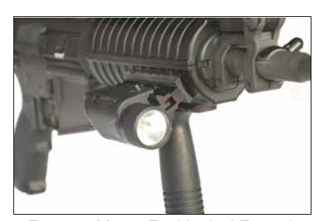
Forearm Mount For Vertical Foregrip