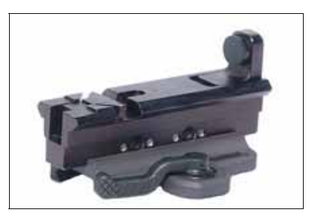
Detachable ARMS 17 Mount