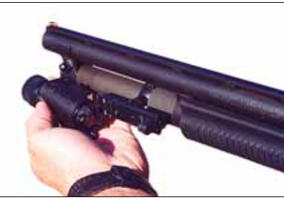
Shotgun I-Mount On Remington