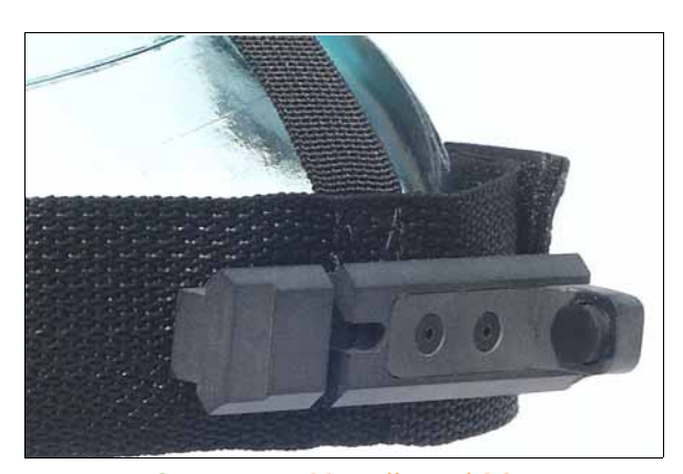
LIGHTLINK Headband Mount