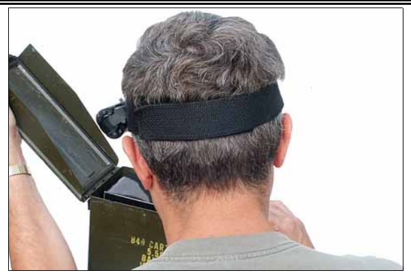
Hands-free search capability.