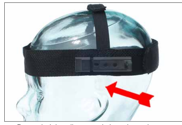
Proper height adjustment is just above the ear.