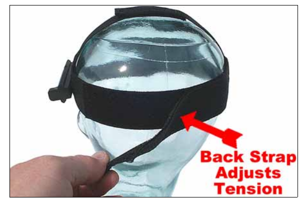
Adjust the tension around your head using the large velcro strap connection in the rear.